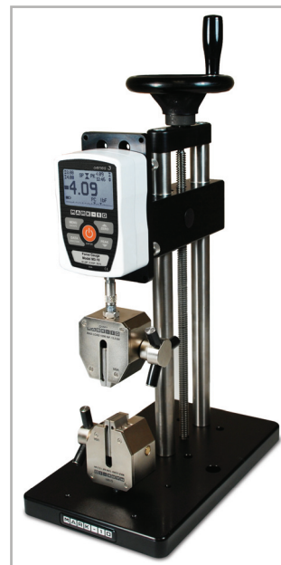
Shown with an ES20 test stand and G1061 wedge grips

An ergonomic, reversible aluminum housing allows for hand held use or test stand mounting for more sophisticated testing requirements. Series 3 digital force gauges are directly compatible with Mark-10 test stands, grips, and software.